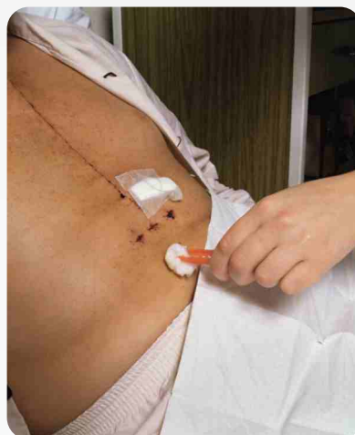
BYPASS SURGERY ANGIOPLASTY VALVE REPLACEMENT