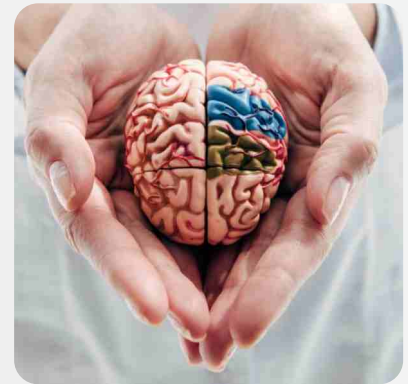
NEUROSURGERY, STROKE, PARALYSIS