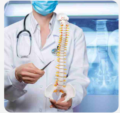
SPINE SURGERY, FRACTURE