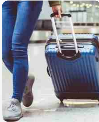
IF YOU NEED TO TRAVEL ON URGENT BASIS & NEED SOMEONE TO LOOK AFTER YOUR LOVED ONES