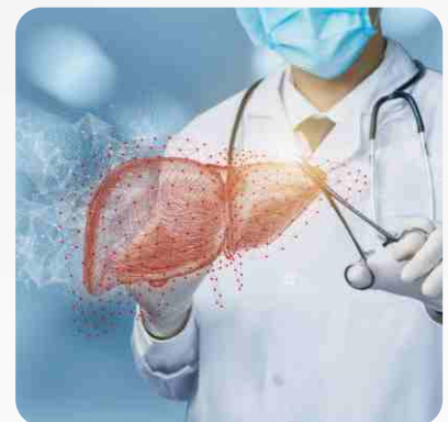
LIVER SURGERY GALL BLADDER SURGERY