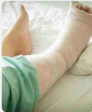
IF YOU HAVE BEEN ADVISED 4 WEEKS BED REST FOLLOWING FRACTURE