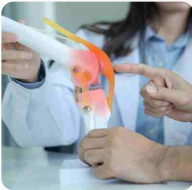
JOINT REPLACEMENT SURGERY