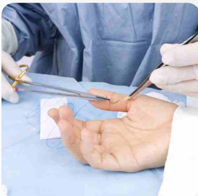
IF YOU NEED TO KEEP YOUR LOVED ONE TILL STITCH REMOVAL