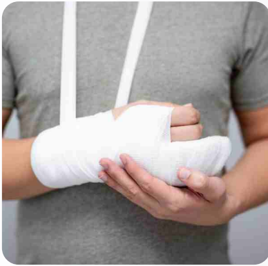
ANY FRACTURE SURGERY